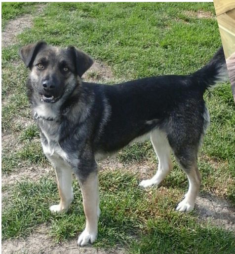
Having been brought to the UK from Romania, Saffron's home fell through and so Wadars took her in. Due to concerns over certain aspects of her behaviour, Saffron took more than 12 months to rehome.