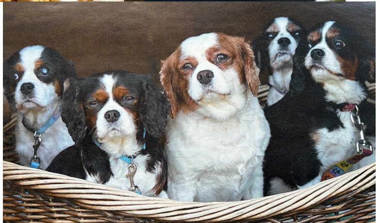
Wadars rescued and rehomed almost 60 ex-breeding Cavalier King Charles Spaniel bitches from puppy farms in Wales after they had outlived their usefulness.