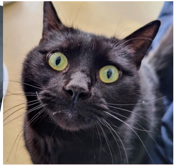
Quentin came to Wadars having been abandoned in a box in central Worthing. We eventually found him an outdoor home at a local country centre.